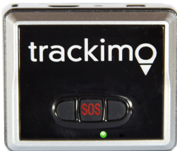
1. Green light will appear when you turn on your device

Short pressing the top power button will display the device status