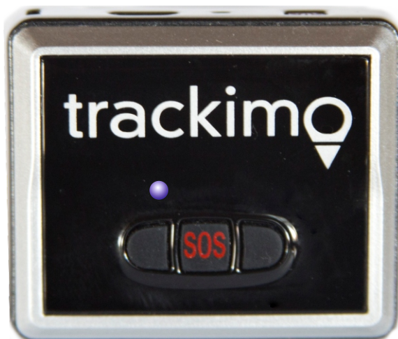
3. Left blue light your device connected to GSM (cellular network)